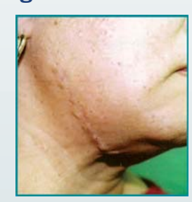
Recurring post-operative scar