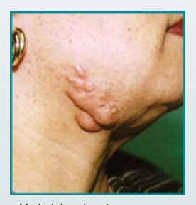
Keloid prior to surgery